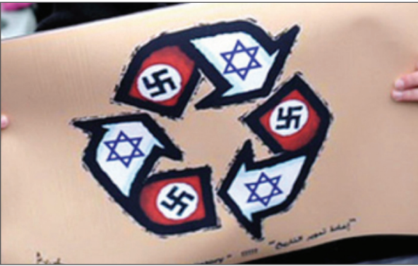
3. Tattoo from a demonstration in Seattle, Washington, January 2009