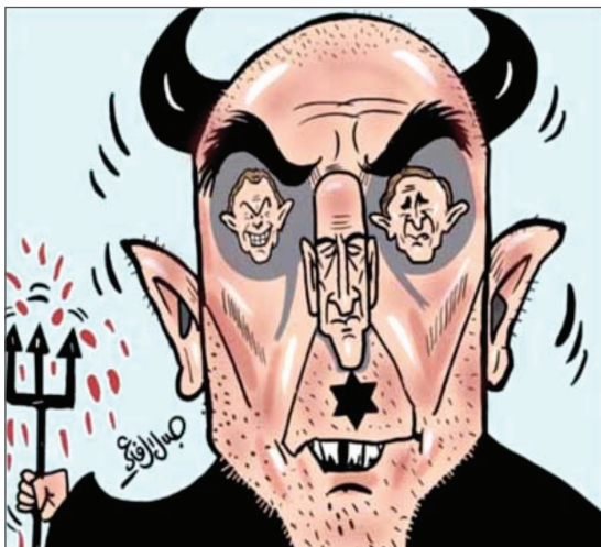
1. Cartoon from a Jordanian newspaper, Ad-Dustur , August 2006