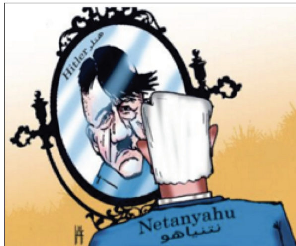
2. Cartoon from Al-Khalij , United Arab Emirates, July 2014