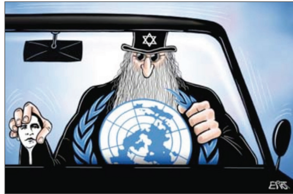
4. Cartoon from a Qatari newspaper, Al-Watan , September 2011