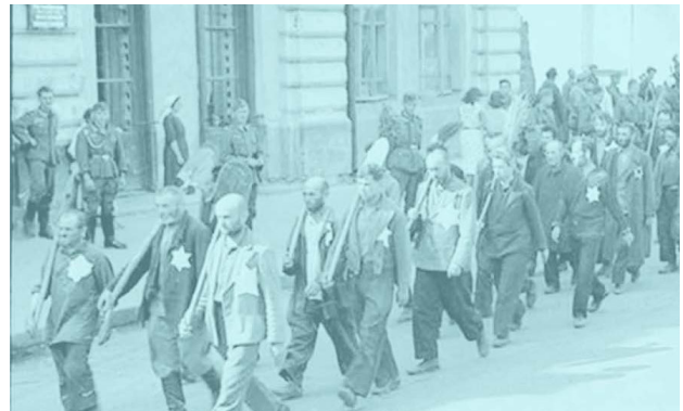
Under guard of the Wehrmacht soldiers, Jews wearing Jewish stars with shovels ("spades") marching through the city on the way to forced labor, Russia, Mogilev, 1941.

to know; nothing could touch the strength of my love, my thoughts, and the image of my beloved. Had I known then that my wife was dead, I think that I would still have given myself, undisturbed by that knowledge, to the contemplation of her image, and that my mental conversation with her would have been just as vivid and just as satisfying.