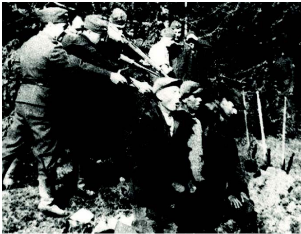
Einsatzgruppen about to shoot Jews on the outskirts of Kovno, 1941–1942.

had been dug beforehand by Jews themselves. In this way many Jewish communities were destroyed entirely.