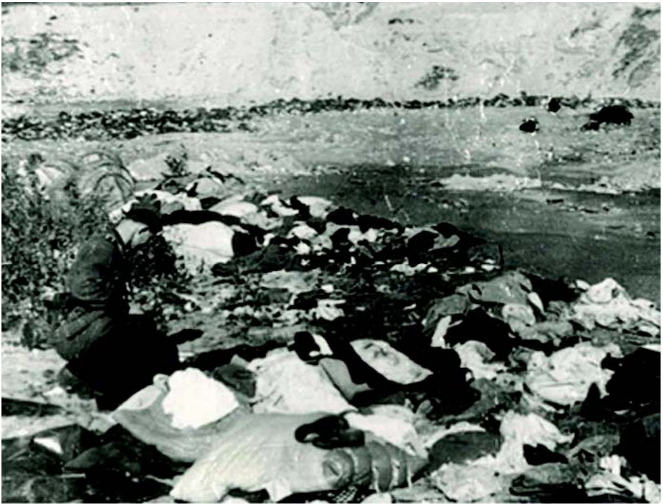
A German policeman searching through clothes of murdered Jews, Babi Yar, Ukraine, October 1941.

Nazi officials of lower ranks often had much leeway in the actual implementation and even initiated various aspects of policy. This idea of those at lower levels taking initiative has been called by the British historian Ian Kershaw “working toward the Fuehrer” (Hitler). Throughout the Nazi period there is a dynamic between the “center” and the “periphery” regarding anti-Jewish activities—while the responsibility for anti-Jewish activities rested primarily with the top leaders, there were many other people of different levels in Nazi German society who made a choice to serve the regime.