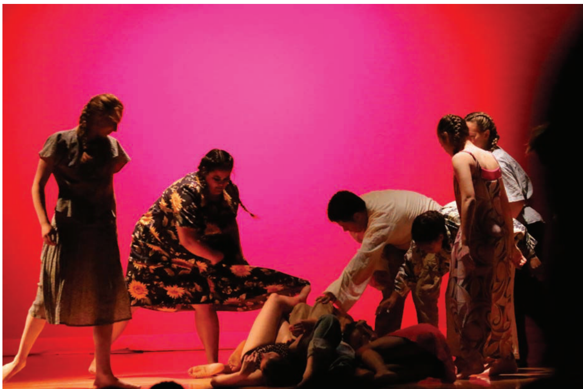
Memorial High School Performing Arts Academy Students.