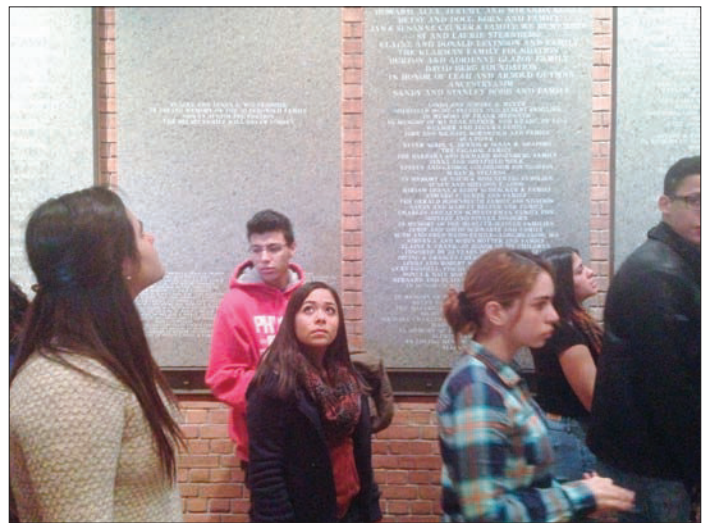
Memorial High School Performing Arts Academy Students at the United States Holocaust Memorial Museum.