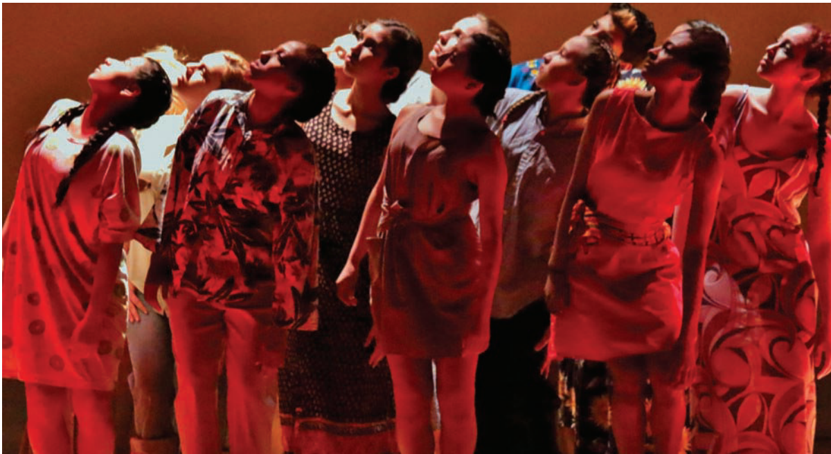
Memorial High School Performing Arts Academy Students.