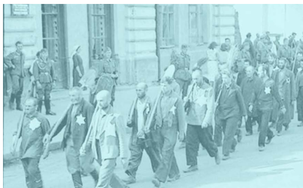
Under guard of the Wehrmacht soldiers, Jews wearing Jewish stars with shovels ("spades") marching through the city on the way to forced labor, Russia, Mogilev, 1941.

to know; nothing could touch the strength of my love, my thoughts, and the image of my beloved. Had I known then that my wife was dead, I think that I would still have given myself, undisturbed by that knowledge, to the contemplation of her image, and that my mental conversation with her would have been just as vivid and just as satisfying.