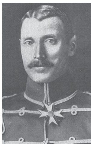
Christian X, King of Denmark

In Denmark, a country located immediately to the north of Germany, the population was able to lead an unusually normal existence in comparison to other countries in Nazi-dominated Europe, until 1943. The Nazis considered the Danes to be “racially kindred” and followed a policy of trying to convince them to become willing allies of Nazi Germany. Because of this and the fact that the Danish armed forces did not oppose the Nazi occupation in April 1940, the German occupiers permitted Denmark to maintain