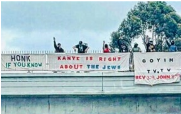
The Goyim Defense League, an American antisemitic hate group, hung banners supporting Kanye “Ye” West’s comments about Jews over a Los Angeles bridge, Oct. 22, 2022.

As COVID-19 spread throughout the world in late 2019 and early 2020 forcing lockdowns in the United States and other countries, a wave of antisemitic conspiracy theories flooded the internet, blaming the Jews for spreading the deadly virus. These actions followed a similar pattern of blaming the Jews for the illnesses of the world, including the classic tropes of Jews poisoning the well or spreading the bubonic plague.