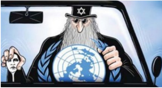
Cartoon from Al-Watan newspaper (Qatar), September 2011