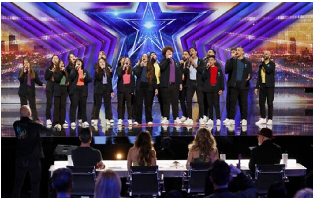
The Jerusalem Youth Chorus performing at an audition for the television program, America's Got Talent, July 16, 2024.

There have been 175 participants so far in the program. One current member is a 17-year-old Palestinian Muslim from East Jerusalem. She joined the program to sing, but found so much more as she was able to meet Israeli teens, and as she told Jeffrey Brown of PBS: “it offered me also a space to share my voice. I feel like, as a Palestinian, you don’t have many of those places where I live.”